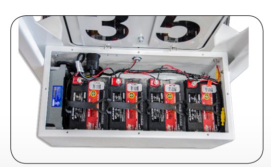
P702-15 (Up to 3 Extra Batteries)