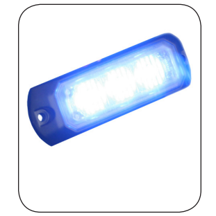
P792-39A, B, R or W Amber, Blue, Red or White High Visibility LED Flasher