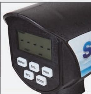
SVR Control Surface