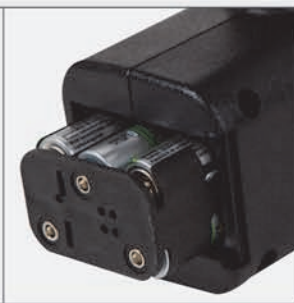
SVR Battery Pack