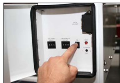
Figure 2 Display Box Switches