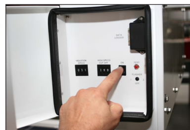
Figure 2 Display Box Switches